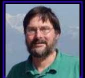
JAMES COPLIEN Founder, Organizational Pattern and Scrum Pattern Language Disciplines