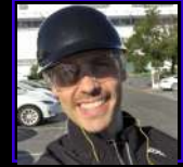
JOE JUSTICE Author, Scrum Master